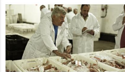
Brixham Fish Market Tours