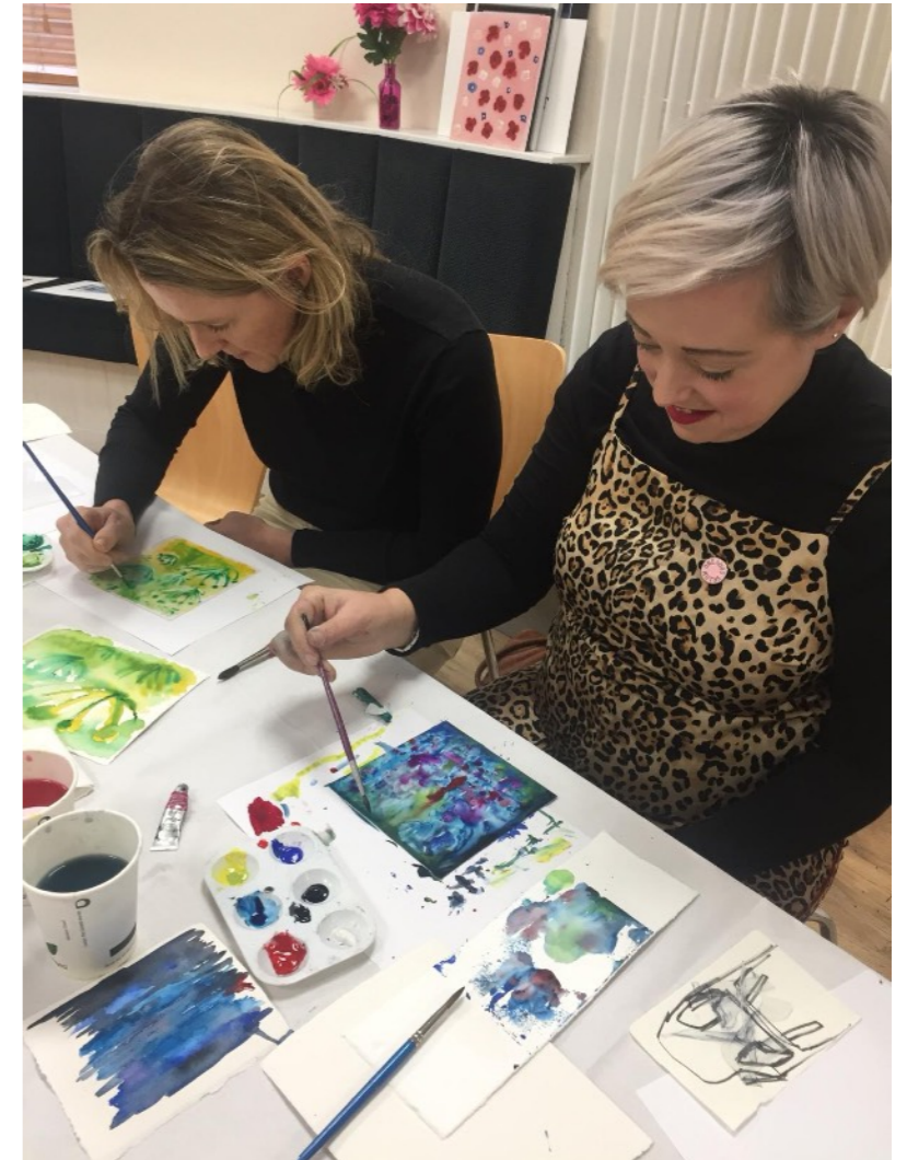
Art workshops in Exeter Community Centre

We also lead creative sessions with the wider community and those who may have been discharged from mental health services. We want to give people an opportunity to share their experiences to support and inform our artists. We also want to generate connections between local cultural and commercial organisations who may support individuals to access creativity and skills development on a longer term basis.